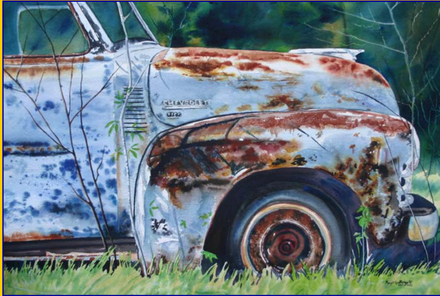
Mary Spelling September 1- October 31