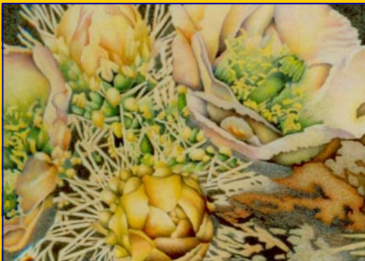
Gayle Hagerty September 29 - October 31 Opening Reception: Saturday, October 3, 6-9 pm