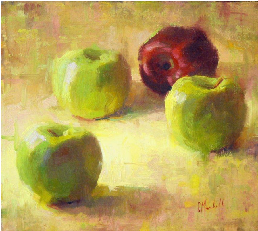
Three Green, One Red 12"x12" Oil on Canvas

Students will continue work on Saturday's paintings. A group critique will wrap up the workshop.