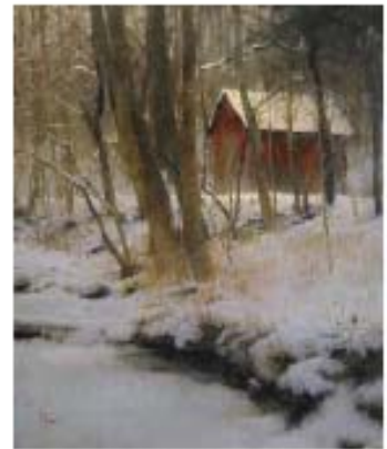
The Red Barn 28"x22" Oil on Canvas