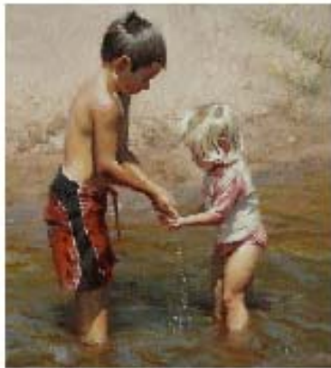
Exploring the Beach 20"x20" Oil on Panel

"You can't just paint what you see in front of you. You have to capture the emotion, hidden in a space, for the viewer to see and feel." Chuck Marshall