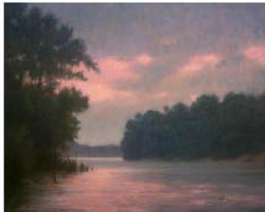
Evening Storm" 24"x30" Oil on Canvas